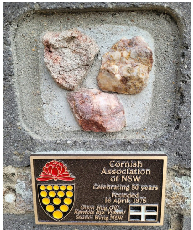
3 Stones from Byng, and the coloured plaque.