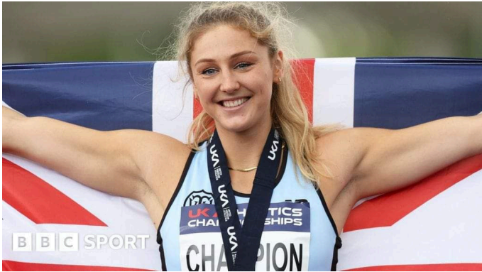
Molly Caudery, Pole Vaulter, from Redruth

24 year old Molly Caudery Pole Vaulter gained the Silver in the 2022 Commonwealth Game, and is now aiming for 2024 Olympics Gold. She is currently the world indoor champion/gold medalist Molly was born in Truro and lives in Redruth, Cornwall.