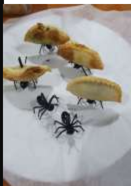
Some lovely emmets carried the pasties to the celebration