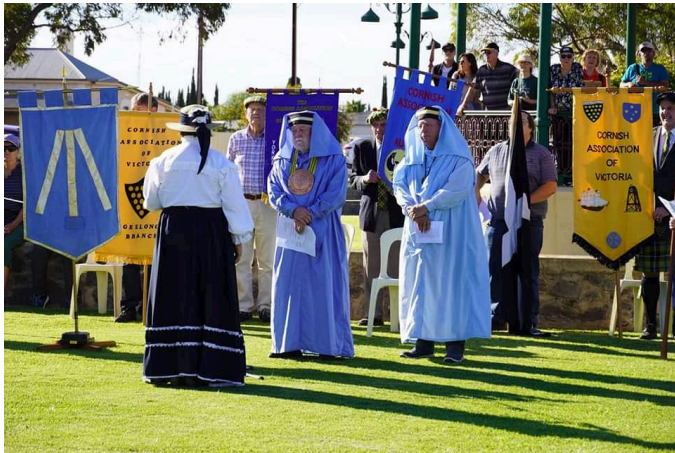
Wallaroo, SA Assembly – May 2022