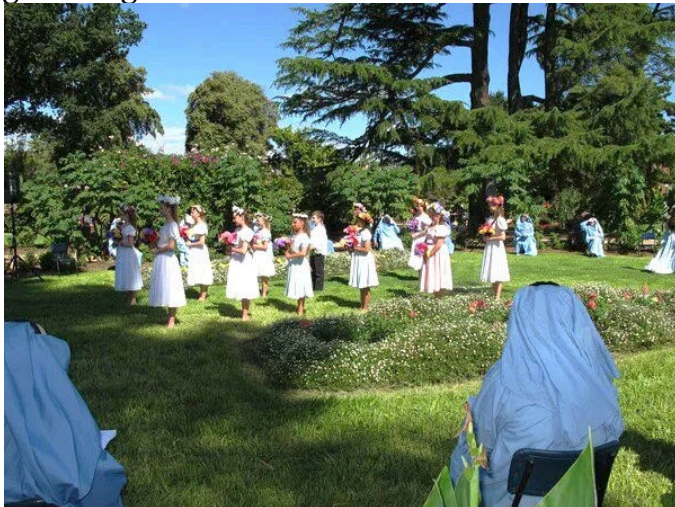
Dancers at an Assembly in Eaglehawk, Vic

There have now been 36 Assemblies held (18 in SA, 16 in Vic., 1 in ACT and 1 in NSW) and the 2 Proclamations. This is the most anywhere in the world other than Cornwall, though there have been a number of proclamation style gatherings held in North America.