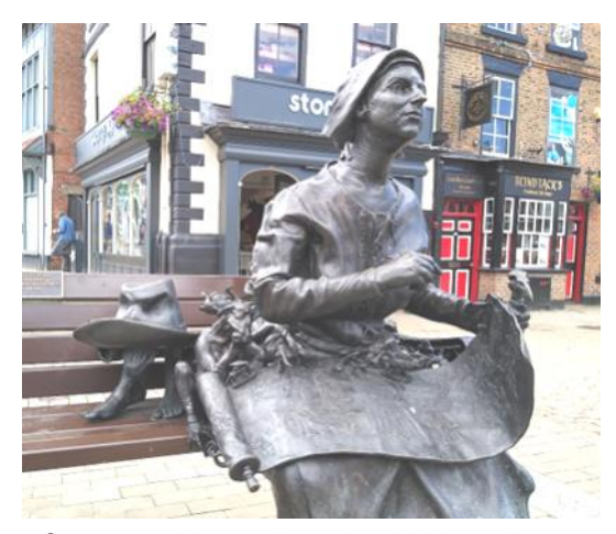
Statue in Knaresbough - Wikipedia

The man appointed to do the work died. A second man, sent to do the work, also died. It would seem that any woman who was offered 1000 pounds for her husband to remove the tree would have adamantly refused, such was Mother Shipton's reputation.