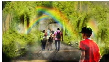
Artist's impression of the rainbow room

The concept for Christchurch is based on water and its journey "From the Mountains to the Sea" (Ki Uta Ki Tai). The promoter of the idea as part of a